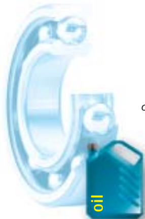
Quantity of oil contained in a greased bearing.

Under the effect of mechanical and thermal stresses, the grease is rolled and driven out of the rolling element / raceway contact area. This loss makes frequent regreasing necessary.