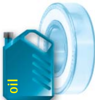
Quantity of oil contained in a bearing with LubSolid.

LubSolid permanently lubricates the rolling elements, thus eliminating the need for regreasing.